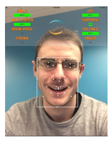
Figure 3: Screenshot of the iOS SDK demo application.