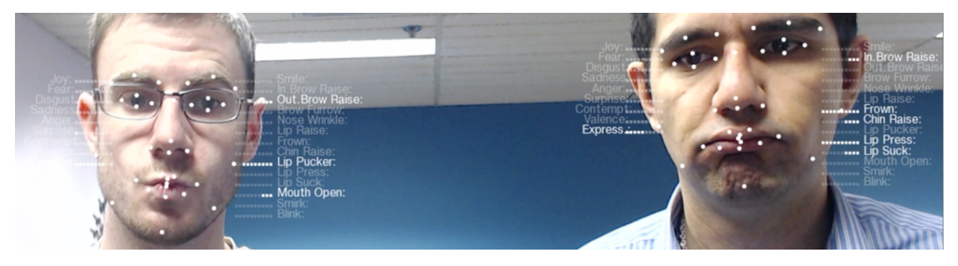
Figure 4: Screenshot of the real-time multi-face expression classification SDK demo application.