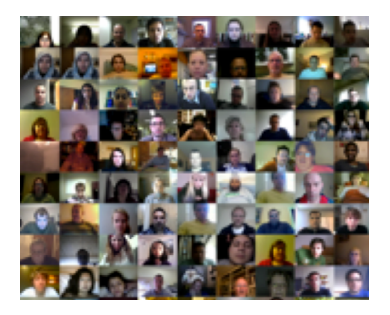
Figure 1: Example images taken from the world's largest dataset of facial videos from over 75 countries in very diverse lighting and surroundings.